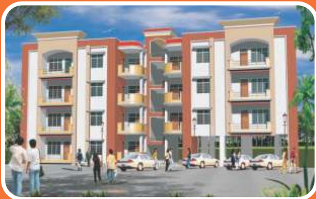
TARANG HOMES, ROORKEE