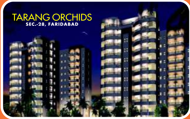
TARANG ORCHIDS SEC-28, FBD.

Successfully delivered the projects & people living happily