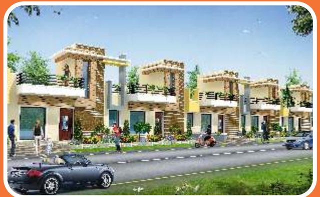
TARANG DIVINE CITY, VRINDAVAN