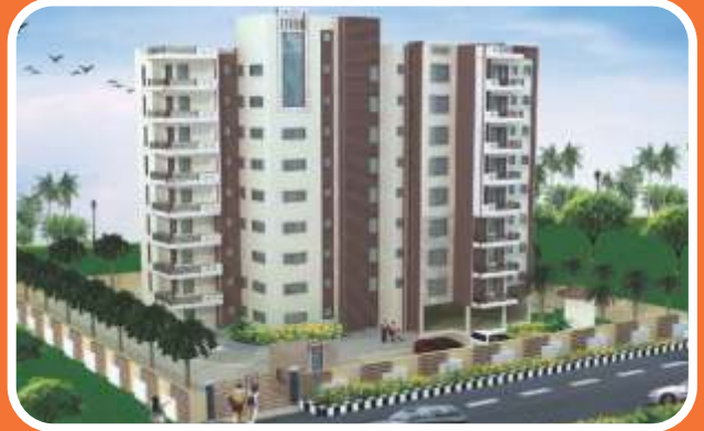
MAHI RESIDENCY SEC-65, FBD